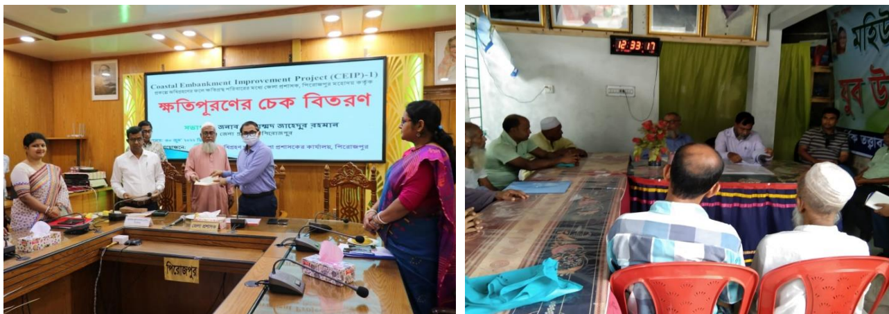
Photo 1: Mr. DC, Pirojpur distributed cheques to awardees of Polder-39/2C and Meeting of the LA Committee with titled APs at Dhawa Mouza under Polder-39/2C.