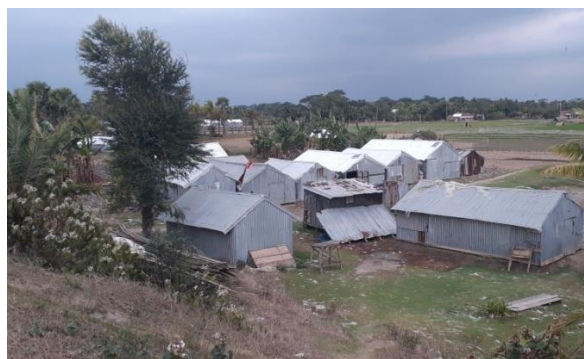
Photo 9: Two different Group relocation site of PoschimKuakata of Polder 48