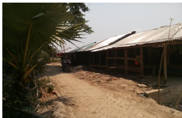
Photo 8: Market Relocation for Anando Bazar, Razapur at Polder 35/1