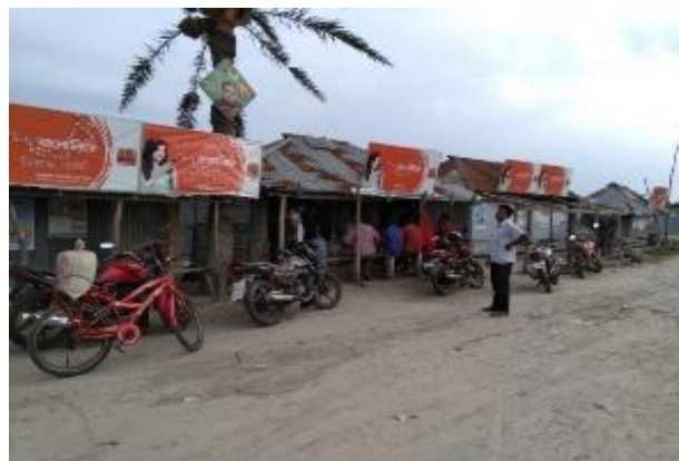
Photo 6: Relocation site at Mollikerber Madrasha Bazar in Polder-35/3