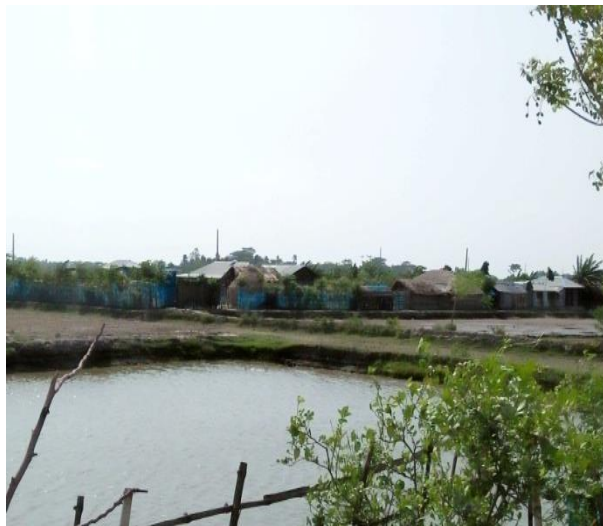
Photo 2: Group Relocation site: Meeting at CEIP Village, Uttar Kamarkhola under Polder-32