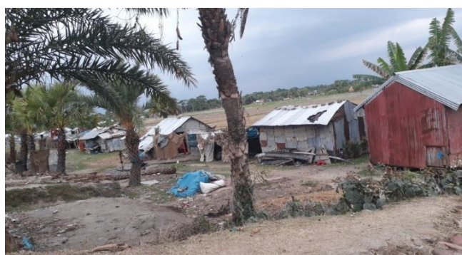
Photo 11: Another group of relocation of Poschim Kuakata of Polder 48