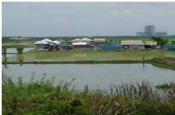
Photo 3: Group Relocation site: Chunkuri (Dangapara) CEIP-1 Resettlement Village under Polder-33